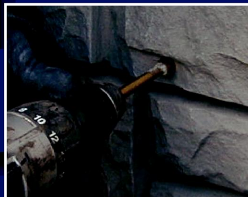
Photo showing a firstner type bit for countersinking anchor hole and one of many types of concrete anchors.

Roto-hammer the pilot hole before inserting or screwing concrete anchors.